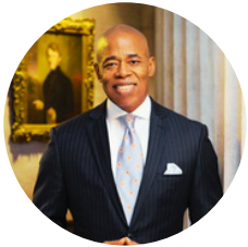
Mayor Eric Adams New York, NY