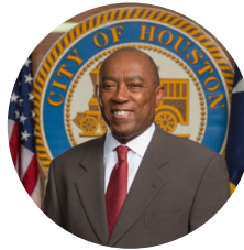
Mayor Sylvester Turner Houston, TX Past President