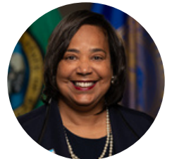
Mayor Victoria Woodards Tacoma, WA