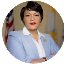
Mayor LaToya Cantrell New Orleans, LA