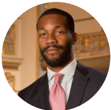
Mayor Randall Woodfin Birmingham, AL