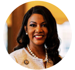
Mayor Tishaura Jones St. Louis, MO