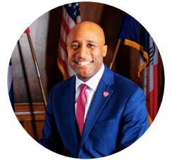
Mayor Quinton Lucas Kansas City, MO